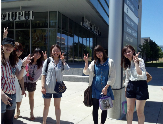
Tsuda program participants explore IUPUI's campus after attending class

"Students like our program because it gives them a chance to practice their English skills in a very interactive, practical way. They stay with American homestay families in the area, and explore cultural activities in the afternoons. They also go on an overnight excursion to Chicago." "It allowed me to really