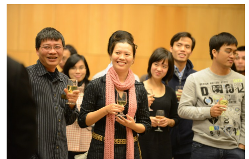
Trainees at the farewell reception

ICIC has hosted international faculty and government officials from Afghanistan, Mali and China in similar programs using its proven English for Specific Purposes (ESP) approach to language teaching. Additionally, ICIC provides group workshops and one-one-one training for international faculty and researchers at IUPUI.