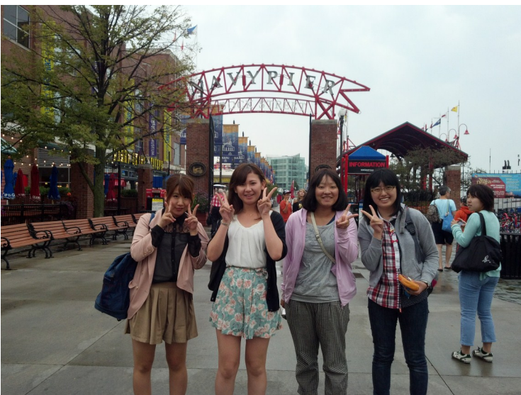
Tsuda program participants enjoy touring Chicago

For more information on the program, contact ICIC at: icic@iupui.edu or (317) 274-2555.