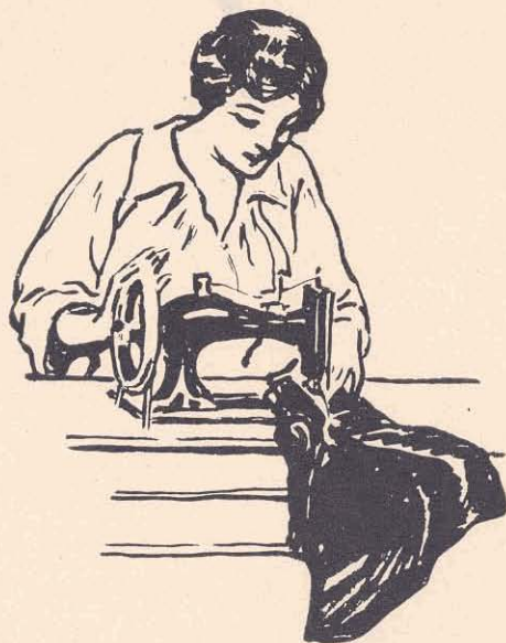
THE WOMAN WHO LEARNS