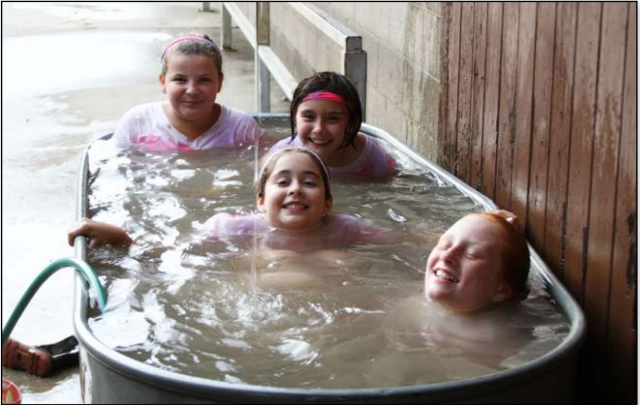
The Foundation's Count Me In! Fund is a field of interest endowment and was created to ensure local kids have a variety of developmental assets available in the community.