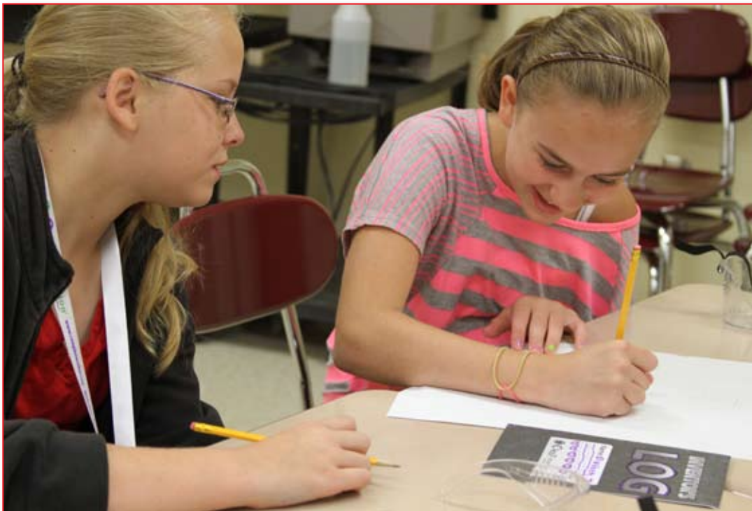
Students from Indian Springs Middle School work on developing positive study habits. Down the road good grades will help determine scholarship awards.

Kenny Simon Scholarship Fund Andy Spencer Memorial Scholarship Fund Nicholas and Laurel Steill Scholarship Fund Ashley Morgan Storm Memorial Scholarship Fund ^ Ross Unverzagt Memorial Scholarship Fund Howard and Mimi Wherry Scholarship Fund Harold "Potch" Wheeler Memorial Scholarship Fund Charles White Scholarship Fund Whitley County Consolidated Schools Scholarship Fund Whitley County Retired Teachers' Association Scholarship Fund Whitko Dollars for Scholars Fund B.V. and Flossie Widney Memorial Scholarship Fund Megan Young Memorial Scholarship Fund Rely C. and Izora Zumbrun Education Fund