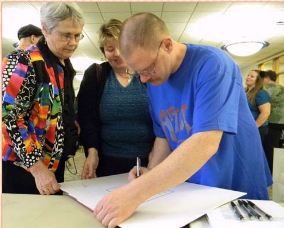
Passages clients had the opportunity to show their talents when their original paintings and photographs were featured in an auction to benefit their stellar art program. Through a grant, the Community Foundation was able to make the lead gift of $100,000 to an exciting capital campaign for Passages, which will bring the dream of a new learning center to reality.