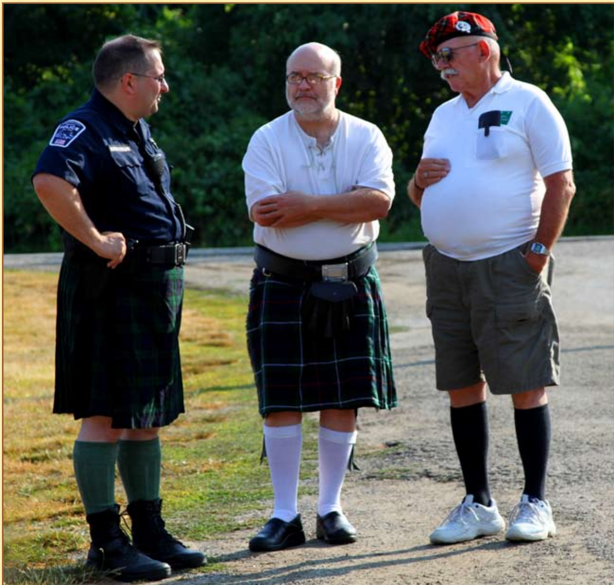
Thanks to a grant from the Community Foundation, a little bit of Scotland found its way to Whitley County when the community hosted a cultural Celtic Festival complete with bagpipes and kilts!

We have made every attempt to acknowledge each gift. If a mistake has occurred, please let us know so that we can correct our records and promptly recognize your gift.