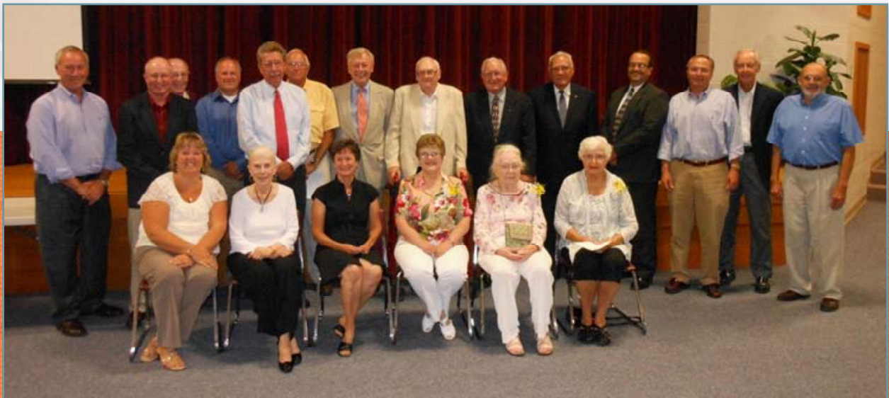
Foundation Board Members, past and present celebrate twenty years of leadership

We celebrated our 20th Anniversary with a party. One of the most touching moments came when watching former and current Board members gather together for a photo. There was a richness in reflecting upon what each individual brought to the Foundation and what their outstanding performance has meant to our community. I continue to believe that the leadership of our Board is unmatched. They routinely