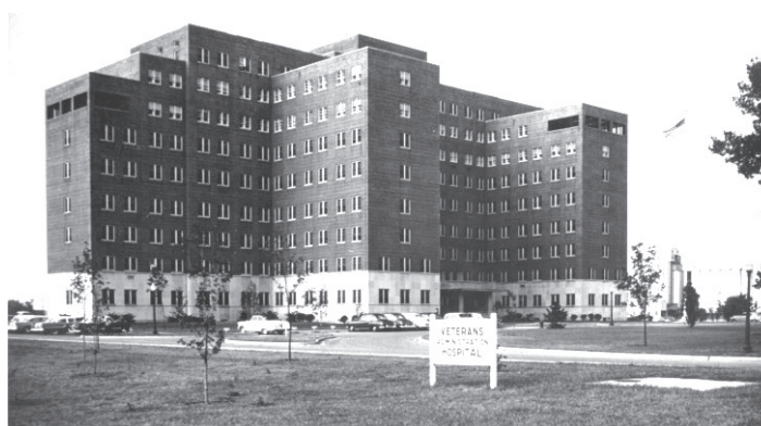
VA Hospital on West 10 th Street - 1955

Expansion of the West 10 th Street VA Hospital occurred: new animal research lab in 1961; 290 bed addition in 1962; 42,000 sq. ft. addition in 1980 (included room for the clinical lab). On August 29, 1982, in honor of the 50 th anniversary of VA hospitals in Indianapolis, the West 10 th Street Hospital was rededicated as the Richard L. Roudebush Medical Center. Roudebush was a native Hoosier who had served as US Congressman in 1961-71. He was prominent in the Veterans of Foreign Wars and served as Administrator of the Veteran Affairs from 1974-77.