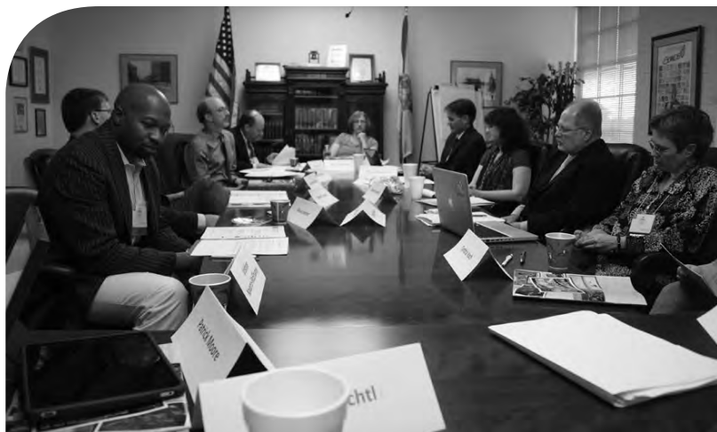
Executive Board Meeting in Pensacola

Between the Fall 2010 and the Spring 2011 and board meetings, the board took the following actions: