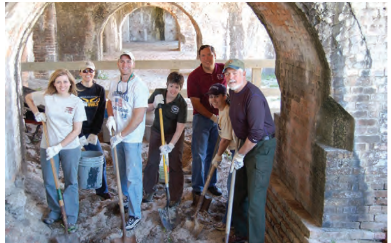
Service Project at Ft. Pickens.