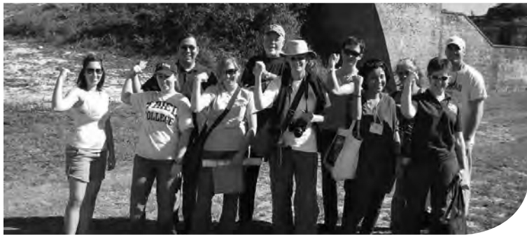
Service Project at Ft. Pickens.

The Opening Reception, sponsored by the History Channel, was a bit windy, but featured a chattering throng of public historians enjoying good food and a view of Pensacola Bay. Like most of the special events, this reception seemed to materialize effortlessly out of nowhere, thanks to the hard work and efficiency of our meeting's hosts at West Florida Historic Preservation, Inc. and the University of West Florida graduate public history program. The reception capped a productive opening day. THATCamp NCPH, one of the earliest and longest events of the meeting, was a bustling success and generated ideas that popped up in other conversations and events throughout the next three days of the conference. (Note: THATCamp and many other aspects of the annual meeting are covered in the NCPH conference blog, at http://ncph2011.blogspot.com/ ) One of the Wednesday field trips, the Public History Community Service Project at Ft. Pickens drew a group of sturdy volunteers who cleared sand and other debris, which earned the gratitude of NPS staff and visitors. You can see the group's photos on the NCPH Facebook page.