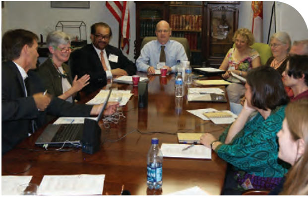
The Public Historian Editorial Board Meeting