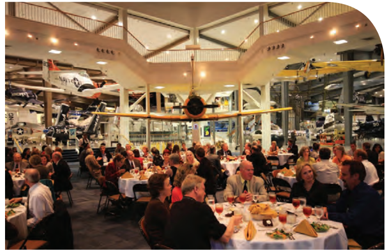
Banquet at National Naval Aviation Museum.