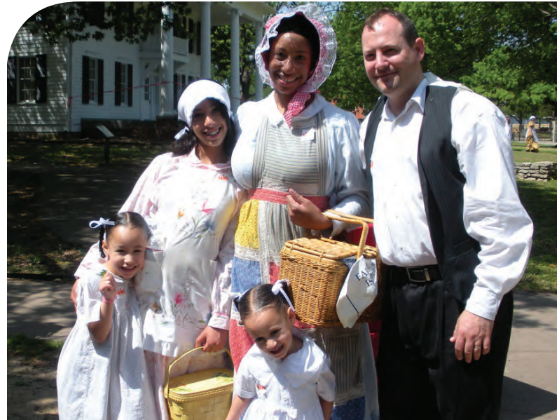
At Dallas Heritage Village's recent Plow, Plant and Shear/Girl Scout Day event, visitors were invited to explore the past through the eyes of Laura Ingalls Wilder. Visitors made sunbonnets, searched for beads at camp fires, completed chores around the village to earn key items for crafts, and listened to selections from the books.