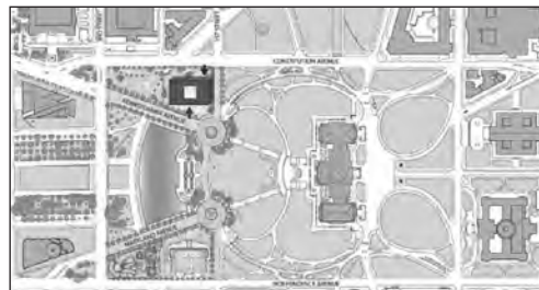
Proposed site of Smithsonian Latino Museum, west northwest of the U.S. Capitol. Courtesy of National Museum of the American Latino Commission Final Report

was announced last year, the proposal to open the Mason-Dixon Gaming Resort a half-mile from Gettysburg National Military Park has drawn immense opposition—an April survey by a national polling and research firm found that only 17 percent of Pennsylvanians supported the idea, with 66 percent actively opposed and 57 percent indicating that such a facility would be "an embarrassment" to the Commonwealth. Last year nearly 300 American historians sent a letter to the Pennsylvania Gaming Control Board in opposition to a proposal to license the casino. Beyond the individual signatories, the NCPH, American Historical Association, National Coalition for History, Organization of American Historians, Society for Military History, and Southern Historical Association sent a separate letter of opposition to the Gaming Board.