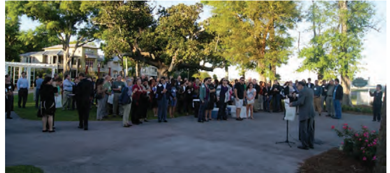
Opening Reception at the Barkley House in Historic Pensacola Village