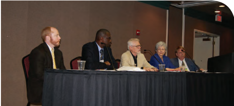
"The Coming of the Civil War Sesquicentennial and Public History" Public Plenary Panel