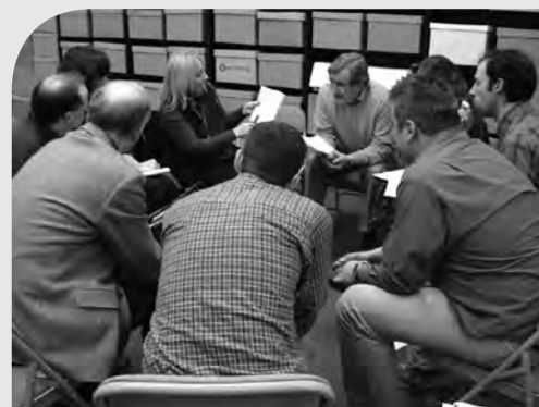
Participants in the "City of Brotherly Love" roundtable discuss topics for The Encyclopedia of Greater Philadelphia . More than sixty people attended this event at the Historical Society of Pennsylvania on March 23.

NCPH members are welcome to participate online at http://philadelphiaencyclopedia.org . The project is based at the Mid-