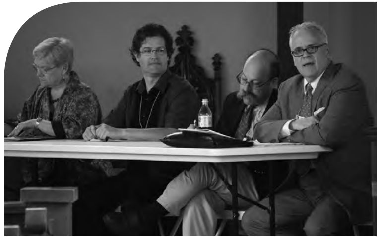
"Collecting the Material Culture of Difficult Subjects" Session.