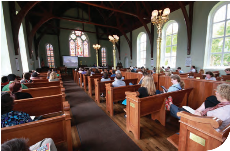
Session in Old Christ Church.