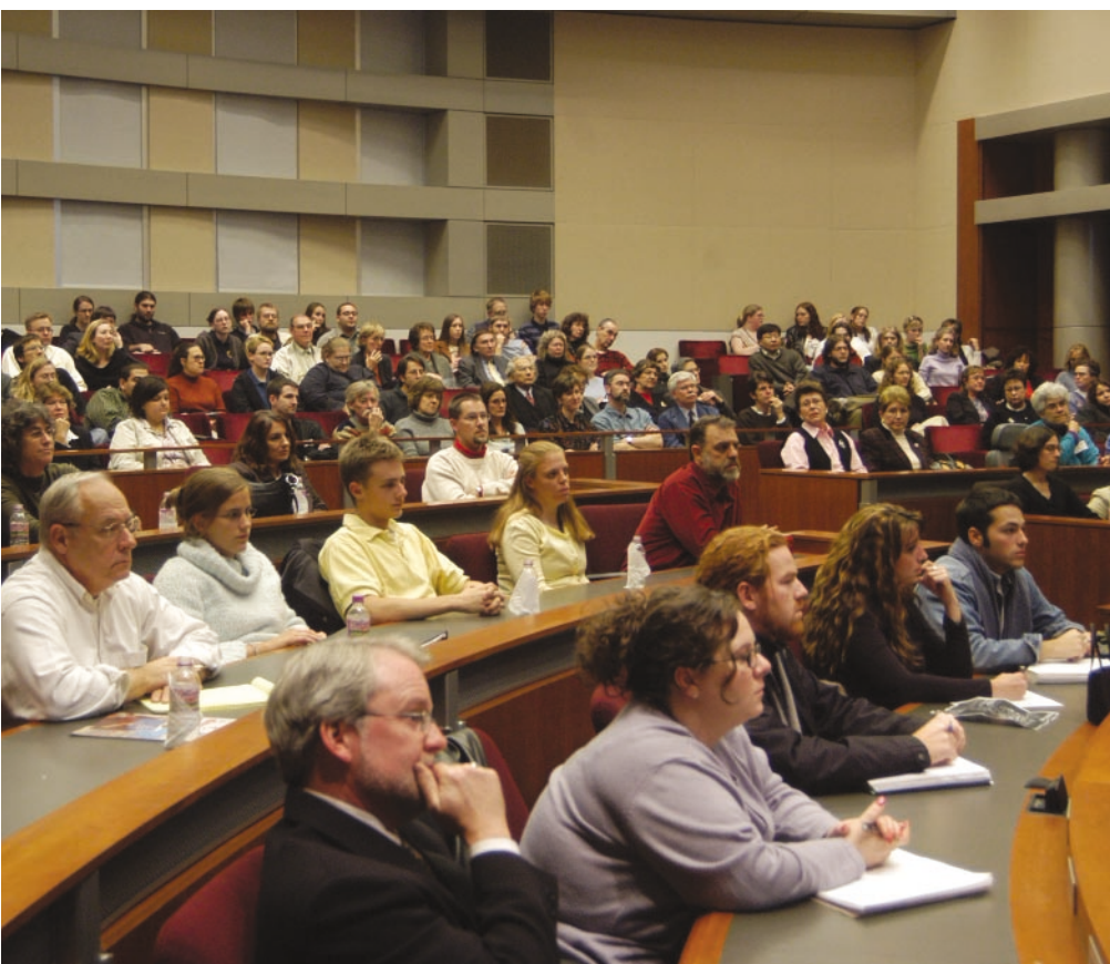
The inaugural Leibman Forum drew a crowd that packed the Wynne Courtroom in November.