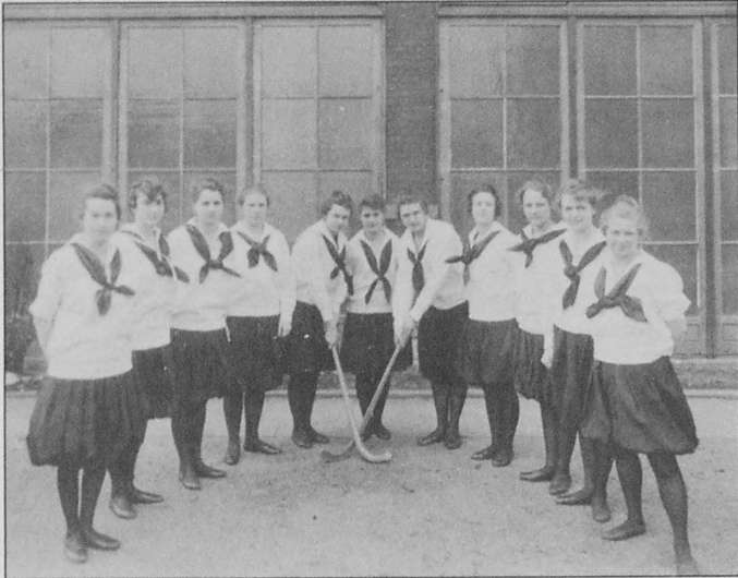
Women's Field Hockey team, Normal College, early 1920s.

A research project about Turner history is looking for help from the Normal College graduates. The Special Collections and Archives at IUPUI is attempting to locate, inventory, and preserve the historical records of Turner Societies in the United States. Although Turner societies were numerous throughout the nation and had many important functions in the German-American communities, research on Turners has been fairly difficult since information on them is scattered or inaccessible. The purpose of this project is to locate published and unpublished materials of Turner societies, to aid in the preservation of historical material, and to prepare a research guide of Turner materials.