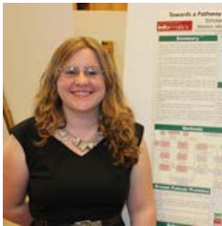
UROP is open to all undergraduate students.