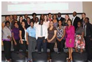
McNair Scholars celebrate success.