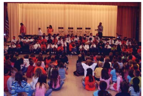
Student enthusiastically participate in the Tiger Track Walking Fitness Program at Krause Elementary.