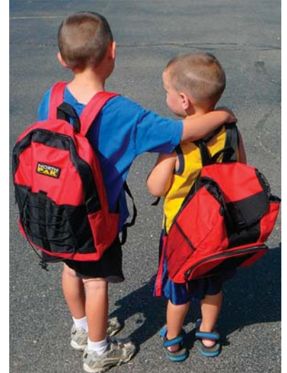
Brothers share a moment after receiving school supplies and backpacks through the Capac Backpack Program.

Children of all ages experienced the outdoors with Wolcott Mill Historic Center’s “Get Hooked on Fishing.” The Mill had fishing poles on hand and volunteers to help with fishing techniques. Parent and grandparent participation in the event surpassed all expectations proving good family fun never grows old.