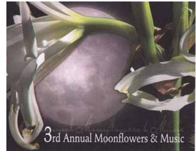
Starkweather's invitation to its Moonflowers & Music Sense the Arts 2006 event.

In the communications arts, the Foundation supported Oxford Community Television's efforts to acquire updated broadcast equipment that is required under the new FCCF regulations. The Oxford Community Television produced a documentary about the Foundation which airs on its station throughout the year. The documentary helps to increase our visibility in the community and share our mission.