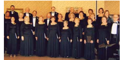
Symphonia Chorale continues to celebrate the seasons with the community.