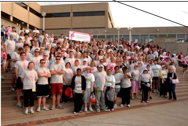
IUPUI Team Photo