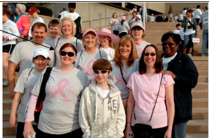
A small part of the 40 member Staff Council Team