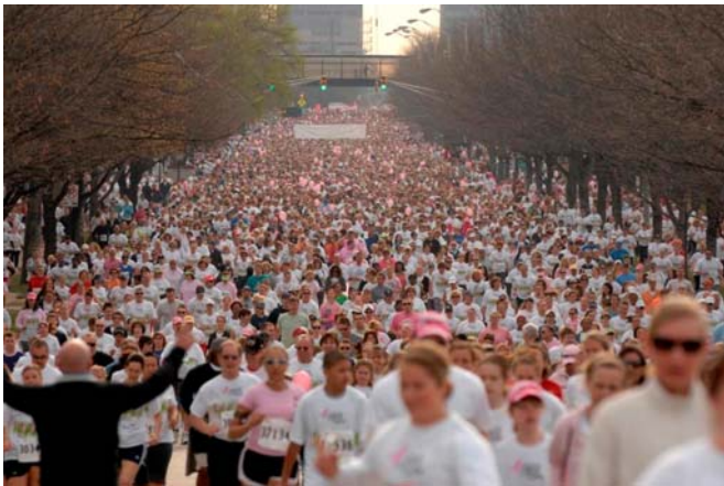
And they're off!