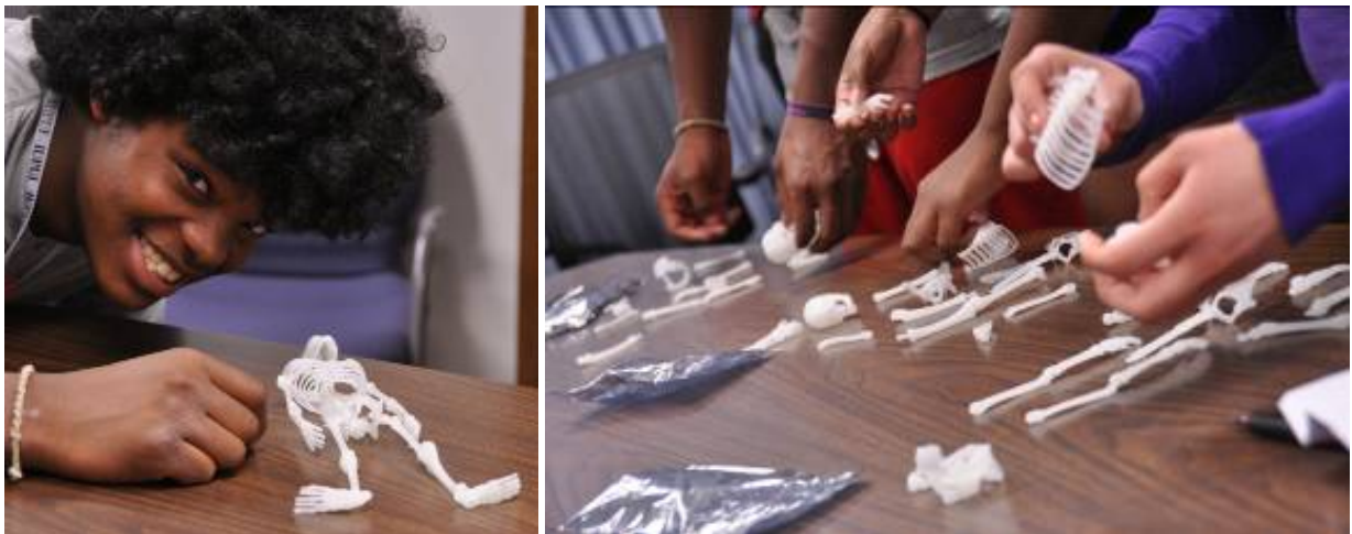
In one week's time, Dental Summer Institute high schoolers learn that a dental education involves a lot more than the mouth. Skeleton construction and brain examining are just two of many hands-on projects the students tackled.