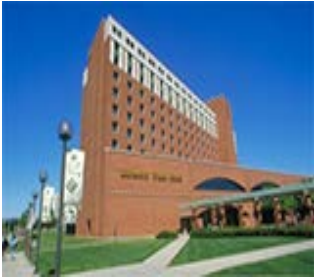
University Tower (HO), Suite 202