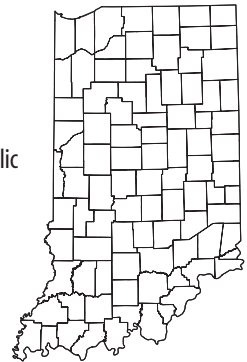
State of Indiana

Much of the research for this report was taken from work completed for the Indiana Office of the Governor and the Indiana Division of Mental Health and Addiction and funded by a grant from the U.S. Department of Health and Human Services' Center for Substance Abuse Prevention (CSAP), as part of the Strategic Prevention Framework State Incentive Grant (SPF SIG) Program.