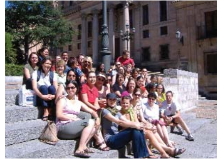
The Summer 2007 students in Salamanca, Spain.

With 100% job placement for graduating students, the Master of Arts in Teaching (MAT) Spanish degree is a degree built for the era of globalization. In the Spanish Program and the Department of World Languages, it allows IUPUI students not only to travel and study abroad, but to absorb another culture first hand and build a career based on their experiences.