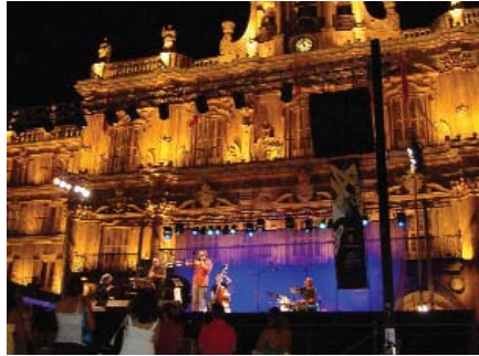
The Jazz Festival in Salamanca's famous plaza.