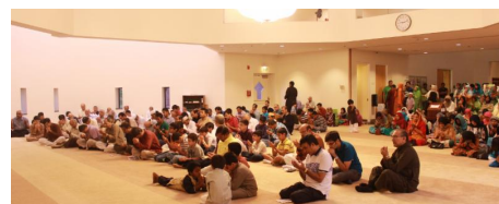
Iftar at ISNA headquarters in 2015 hosted by Indianapolis friends of OBAT

If you observe Ramadan, like most followers, you host an iftar or two. Iftars, as you know, are an opportunity