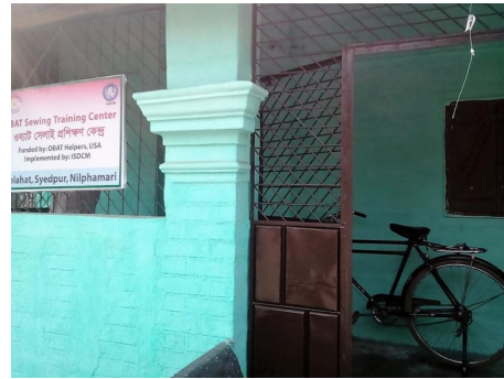
Outside view of Golahat sewing center

A new sewing center has been set up in Golahat, Syedpur. The camps it will cover in this area include Golahat camp no 1 and 2, Cinema Hall and Islambagh camp. At present, the center has one instructor and sixteen students. The center runs in two hour batches lasting for two hours during the day. The duration of one course is four months.