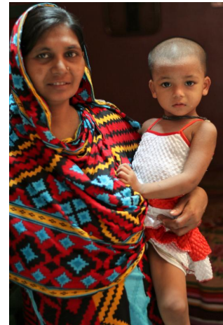
a camp woman poses with her child

Special days are always marked in the camps in meaningful ways. On International Women's Day on March 8th, an MOU was signed by OBAT with Surjer Hasi (previously Smiling Sun Clinic) to provide pre and post natal maternity care services to the women in Syedpur camps. Debilitating poverty does not allow camp women to seek such services otherwise. However, with the help of this clinic, they will be able to access them for free.