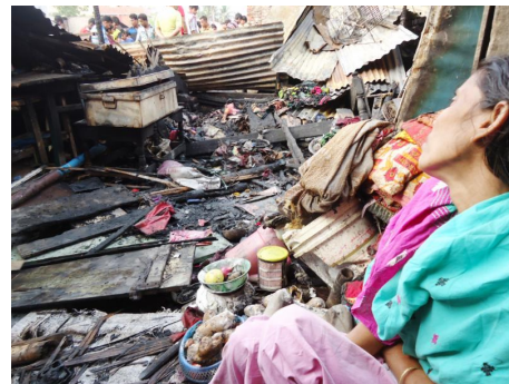
A woman stares painfully at her destroyed home

Essential household goods were provided to the victims by OBAT. The staff of Khulna educational projects donated one hundred Takas each to supply breakfast for the victims' families. The government and Khulna's mayor also extended some help to these unfortunate souls.