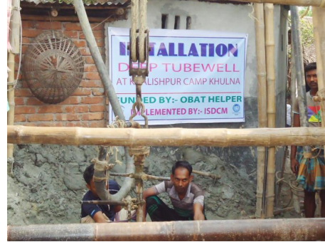
Installation of tube well in progress

critical issue of fresh drinking water. The total population of this camp consists of 147 families. About 70 families have directly benefited from this tube well.