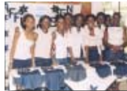
Students that won the best company of the year award in Cote d'Ivoire displaying their products.

The president and first lady of Cote d'Ivoire held a luncheon in their residence for the executive members of the National Council of Employers of Cote d'Ivoire and the top 15 patrons of JA Francophone Africa's Enterprise Club. ▲