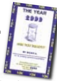
This is the cover of the Y2K booklet JAI students in the Bahamas created as part of JA's Company Program. The students made $22,000 selling it.