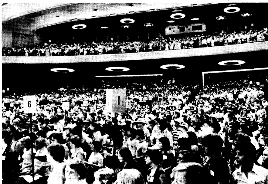
GENERAL SESSION. The beautiful Indiana University auditorium is used as the setting for the Achievers' general sessions.