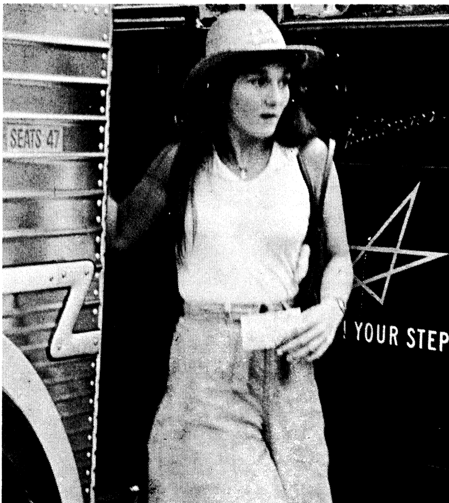
A weary delegate cautiously steps off the bus on her way to the "best week of her life".