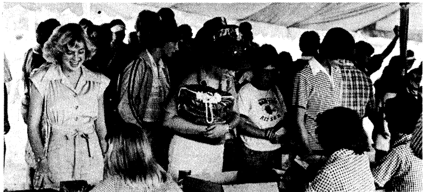
REGISTRATION TENT. The registration tent proved to be a busy site, as delegates from across the country arrived by the busload yesterday, to begin the 34th NAJAC.