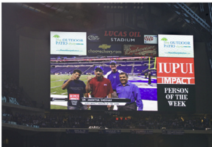
IUPUI Impact Person of the week