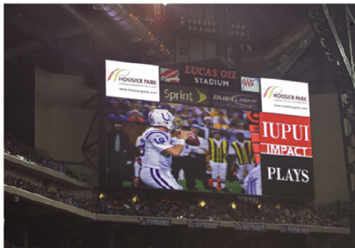
IUPUI Impact Plays