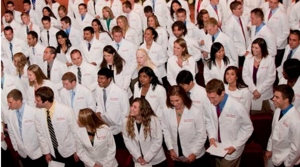
A scene from last year's White Coat Ceremony for the DDS Class of 2014