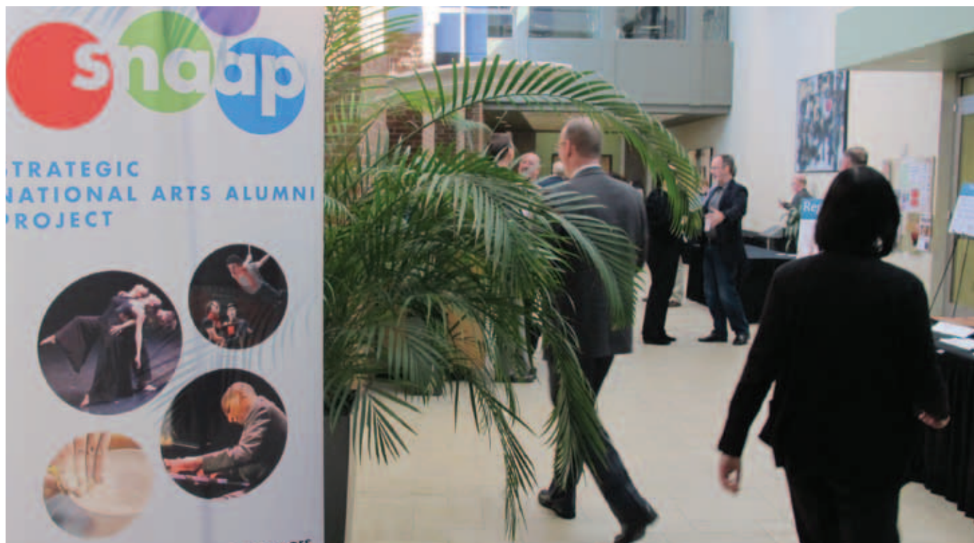
The SNAAP conference at Vanderbilt University in March