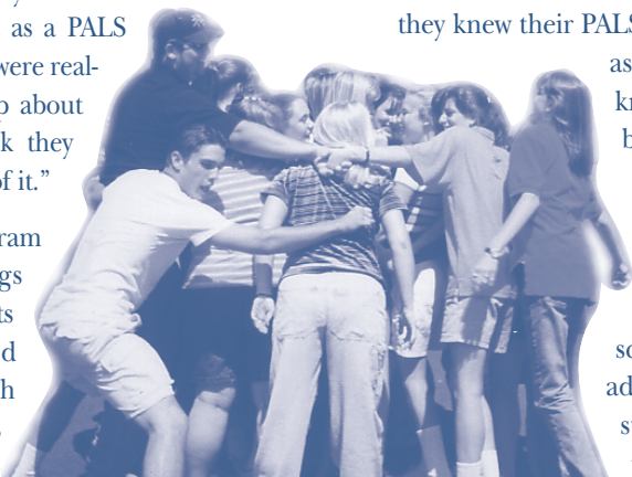
Cabot, Arkansas, FFA members work on an activity for their High School Heroes presentation.