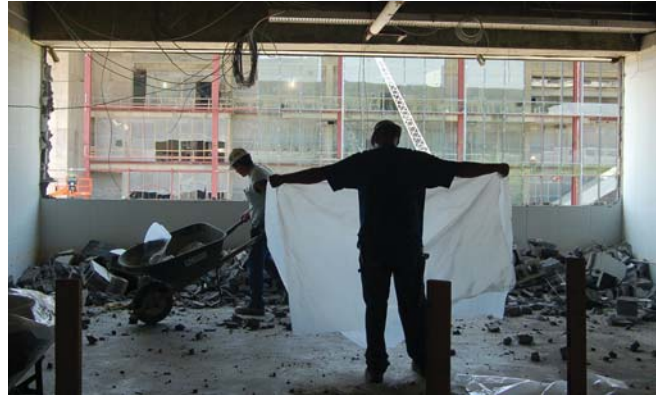
A view from the inside out on the day the wall was knocked down to make way for connector.

Behind a gray plastic sheet, chaos reigned as a giant hole appeared in the west wall and sun broke through into the second and third floors of Cavanaugh Hall. Something electrifying and wonderful was unfolding in the sun of a bright spring day at IUPUI.