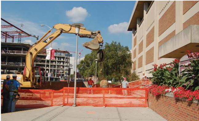
In the fall of 2006 the facade of a portion of the building and the concrete overhang were removed with a wrecking ball.