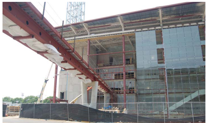
Underneath the bridge from Cavanaugh Hall facing the Campus Center.