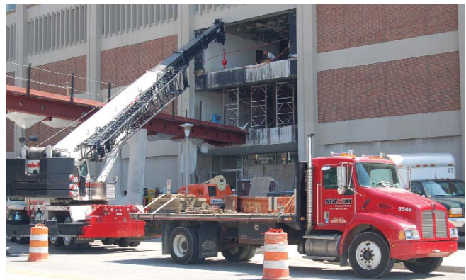
The progress as of May 2007. The structure of the "gerbil tube" and the two-story entry are slowly taking shape.

If you are interested in seeing sparks fly, go to http://liberalarts.iupui.edu . We were so excited by the changes coming, we filmed it and took photos. Turn down your volume—this breakthrough is LOUD!