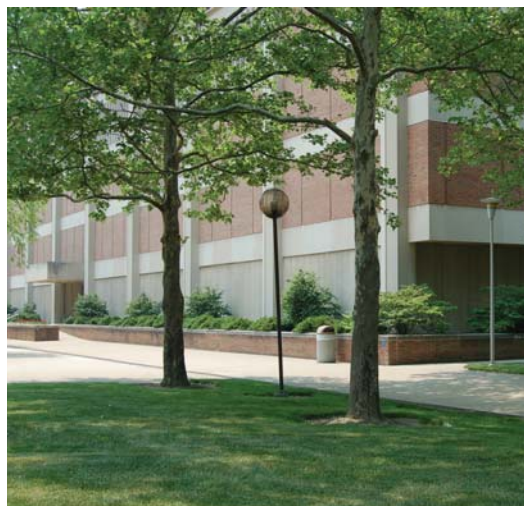
Cavanaugh Hall's peaceful side.