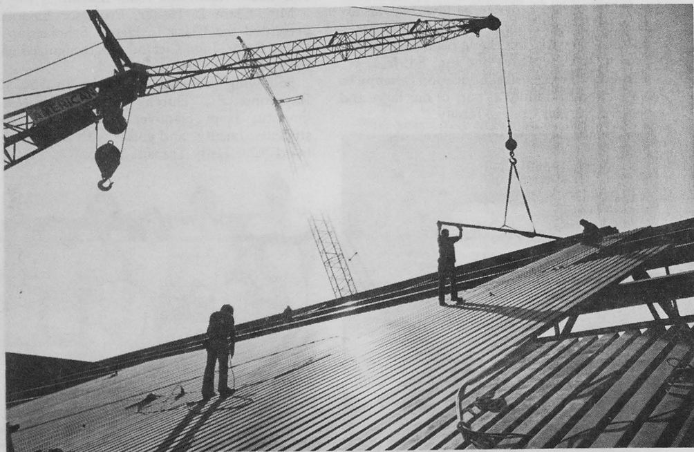
Workmen hoist beams for the ceiling of the Physical Education/Natorium Building.