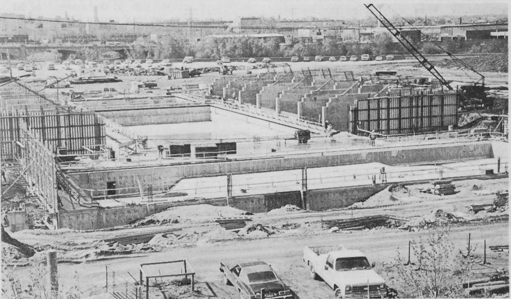
Construction of the Physical Education/Natorium Building is moving along on schedule. The building is expected to be completed in time for the National Sports Festival in July of 1982.