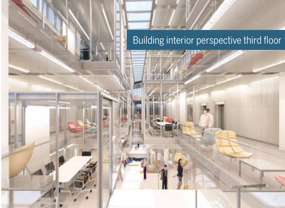
Building interior perspective third floor