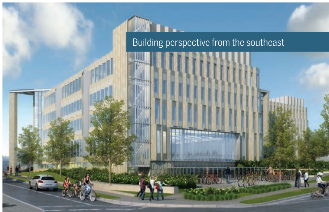
Building perspective from the southeast

Following the guidelines of the master plan, the new building will adhere to the principles of creating large quadrangles while also providing public space. The building will be L-shaped and define the corner of Woodlawn and Cottage Grove. An extensive landscaped setback featuring a double row of trees along Woodlawn will create new pedestrian access to the core of IU's campus. A grand civic porch