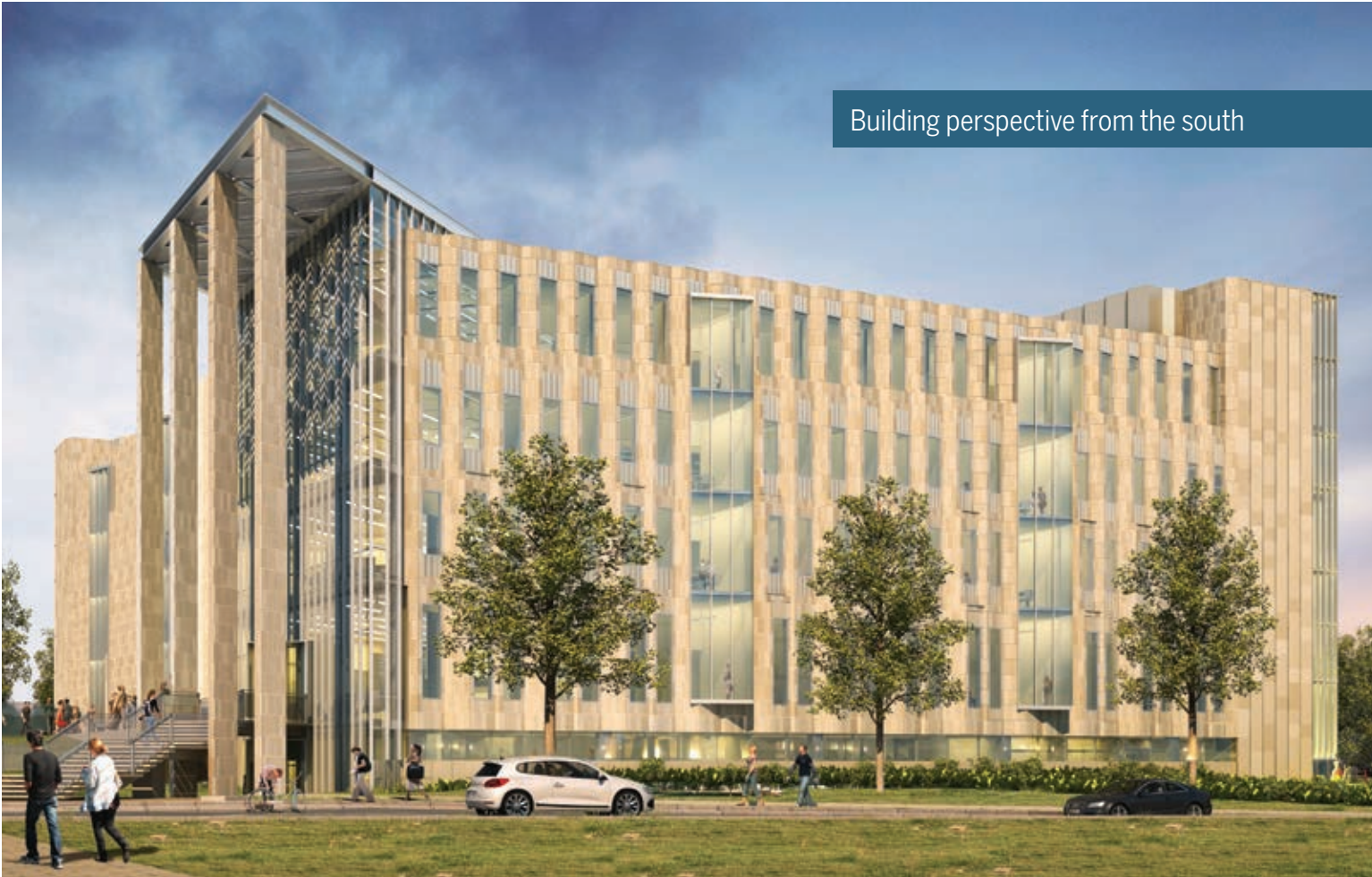
Building perspective from the south

Fundraising disclosures: http://go.iu.edu/89n