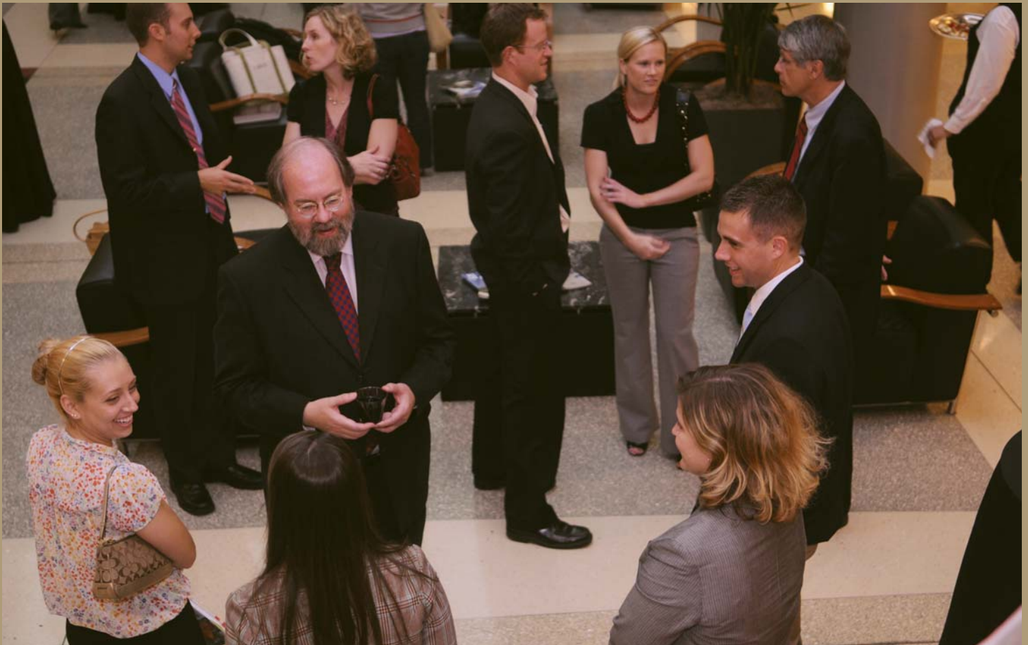
Chief Judge Easterbrook chats with students in the atrium during the Indianapolis Bar Association's reception for the court.