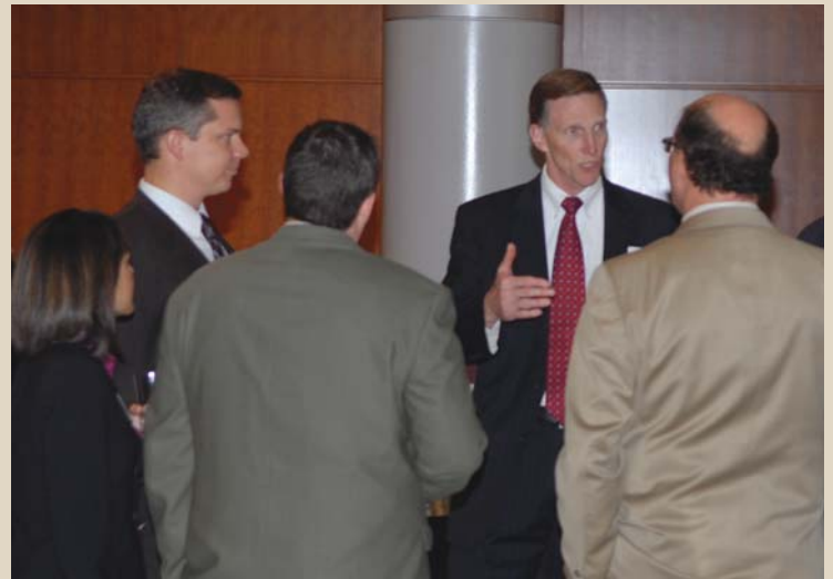
John Pistole, '81, (center) Deputy Director of the FBI, chats with community leaders and law school administrators at the reception.