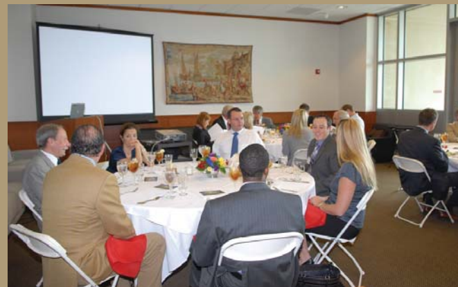
Students had an opportunity to chat with successful alumni in the business field during the law school's Entrepreneurial Luncheon in September.