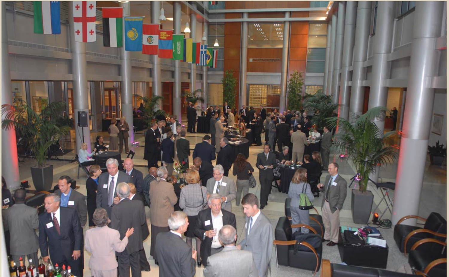
More than one hundred people celebrated in the law school's Conour Atrium.