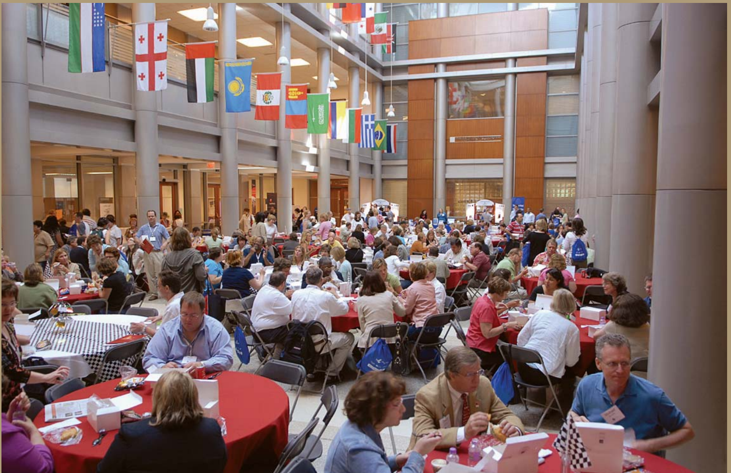
Over 600 legal writing faculty members from 13 countries attended the biennial LWI conference in Inlow Hall. Participants ate lunch in the Conour Atrium.