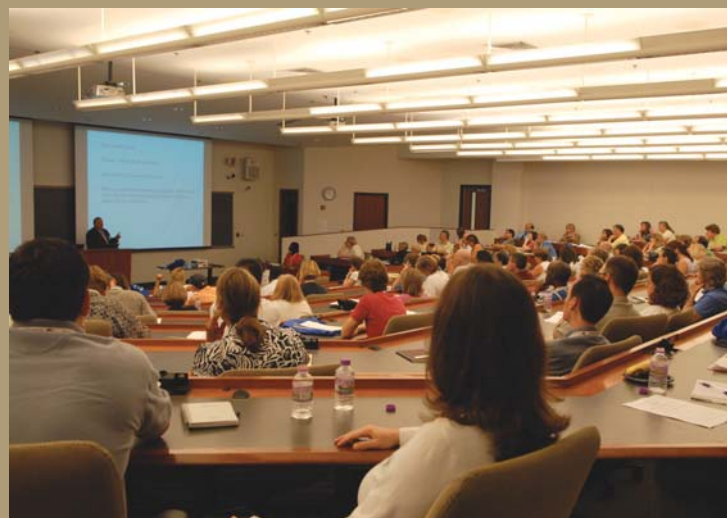
LWI conference participants attended sessions throughout Inlow Hall during the four-day event.

The Legal Writing Institute (LWI) is a non-profit organization dedicated to improving legal writing by providing a forum for discussion and scholarship about legal writing, analysis and research. The LWI has more than 2,200 members and includes representatives from 38 countries. ■