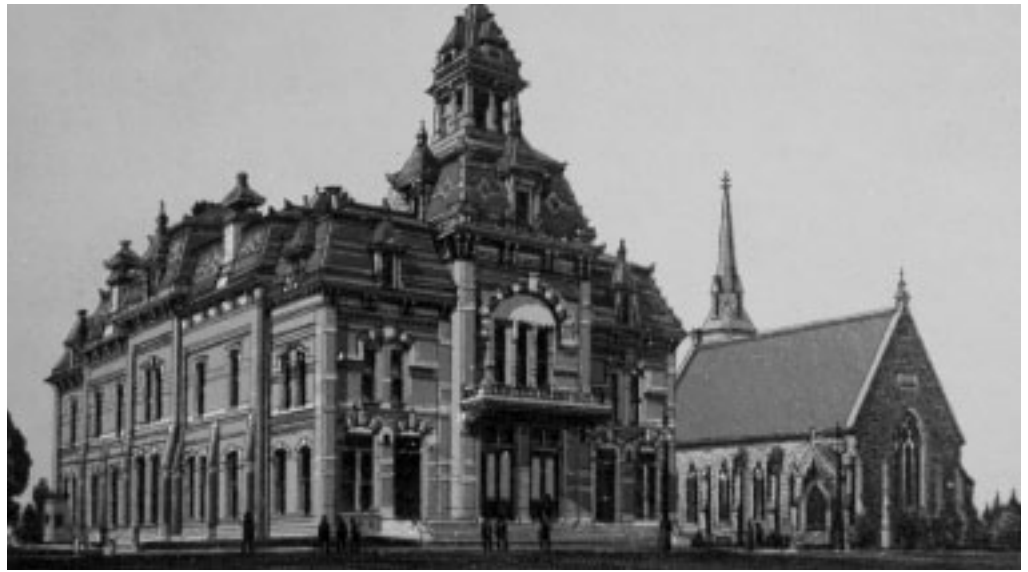
The Central Branch is in Dayton, Ohio, and is now the Dayton VA Medical Center. Memorial Hall (left) no longer stands, but the Home Chapel, built in 1868, remains on the grounds.

All honorably discharged Union veterans disabled as a result of their service were eligible to enter the National Home. The