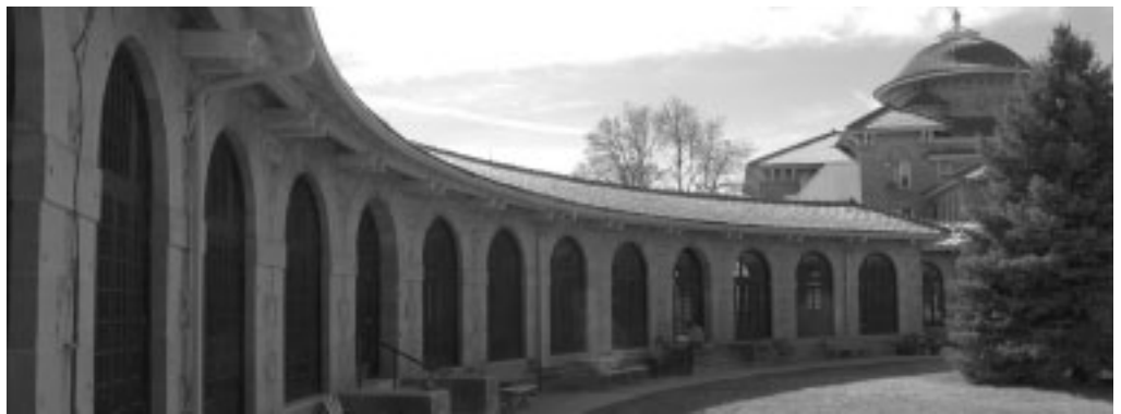
Built in 1907, the hospital at Battle Mountain Sanitarium in Hot Springs, South Dakota, includes this beautiful central court. Battle Mountain was the only branch established as a medical facility rather than a residential facility.

Board of Managers initially assumed that population of the institution would decline as veterans regained their strength and returned to active life. However, in 1884 Congress expanded eligibility to Civil War veterans disabled for any reason, including age, and the broader standards led to increases in membership. The Board of Managers subsequently established additional branches: the Western Branch in Leavenworth, Kansas, in 1885, the Pacific Branch near Santa Monica, California, in 1888, the Marion Branch in Marion, Indiana in 1890, and the Danville Branch in Danville, Illinois, in 1898.