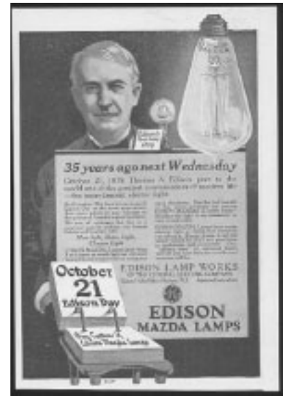
A 1914 advertisement commemorating the 35th anniversary of Edison's invention of the incandescent lamp.