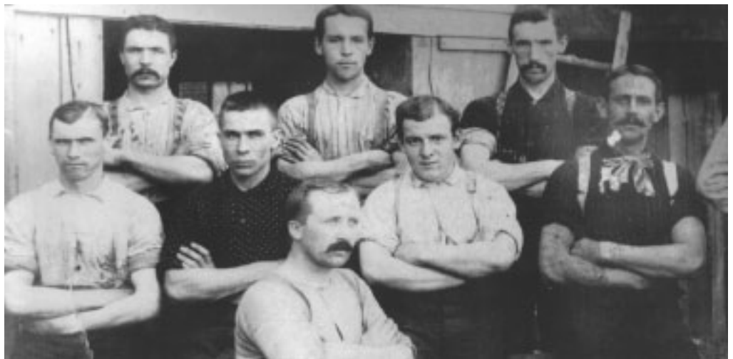
Irish day laborers provided the first immigrant work force in Holyoke, having arrived in 1847 to construct the new dam and mill buildings. This photo is of mill workers in Holyoke, c.1850s.

importantly the conference provided me with examples of ways to present history that is sometimes contested. These new ways to present history are directly relevant to my work as Curator at Wistariahurst Museum in Holyoke, Massachusetts. Holyoke, best known as “The Paper City,” was built using immigrant labor. Immigrant groups like the Irish, French Canadians, Polish, Germans and Italians have left a permanent mark on the city. These traditions of the immigrants endure in the St. Patrick’s Day Parade, the Franco-American Club, and Polish Folk Dancing. A more recent migrant group are the Puerto Ricans, who have been struggling to find a sense of belonging and sense of themselves as citizens of Holyoke and as mainland Americans. However, the traditions of these immigrants and migrants endure in the cultural life of Holyoke with their enclave communities, ethnic churches, organizations, and celebrations.