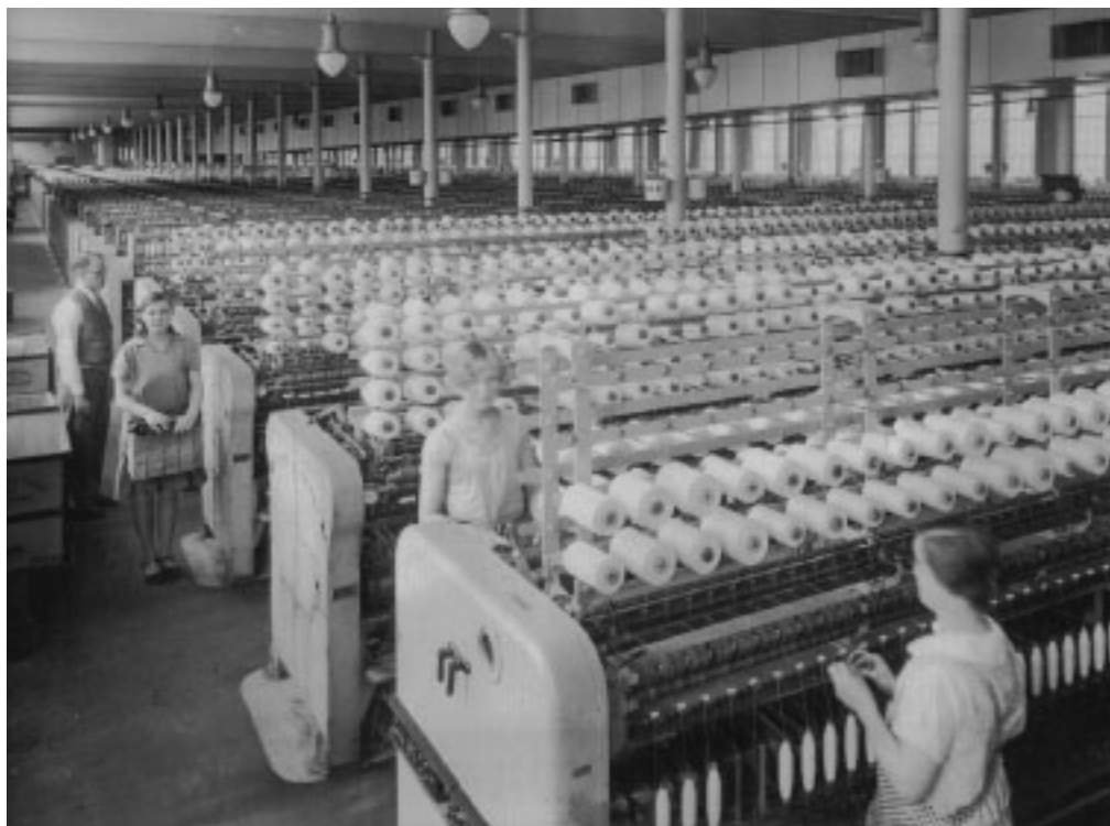
The spinning department at the Farr Alpaca Mills in Holyoke showing women working as doffers and spinners.