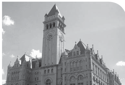
The Old Post Office Pavilion, Washington, D.C., longtime headquarters of the NEH. President Obama's 2013 budget request includes $3 million to relocate the NEH offices. Donald Trump will be converting the Old Post Office into a luxury hotel.

see its funding slashed by $2 million from the current $5 million to $3 million, a 40 percent reduction.