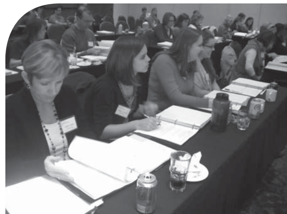
Attendees at workshop, with curriculum binders.