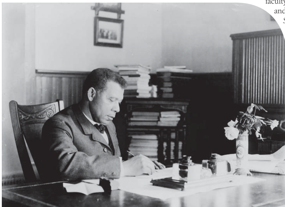
Booker T. Washington.

The workshop was structured around three main objectives: first, to provide guidance to teachers seeking to add depth and breadth to their teaching about Washington as part of the standardized social studies curriculum; second, to offer perspectives and materials that moved beyond simplified versions of Washington (as a foil to W. E. B. DuBois, a heroic pathbreaker, or a vocational schoolmaster); and, finally, to situate the life and legacies of this historical figure across layers of local, regional, national, and global history. The latter objective was facilitated by Washington's direct connections to southwest Virginia, including his birth in Franklin County and role as superintendent of the Christiansburg Industrial Institute.