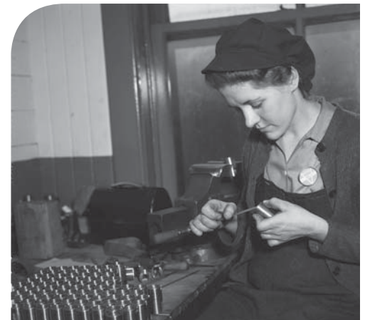
A Milwaukee war production worker, 1943, on the frontier of capitalism and democracy.

Friday, April 20, 8am – 10am Join the NCPH Membership Committee and other first-time conference attendees and new members for conversation and breakfast. (Tickets are $25, available by preregistering.) This is a great way to meet new and old members of the organization and to learn more about NCPH, the conference, and the field of public history. Cosponsored by American University and the NCPH Membership Committee