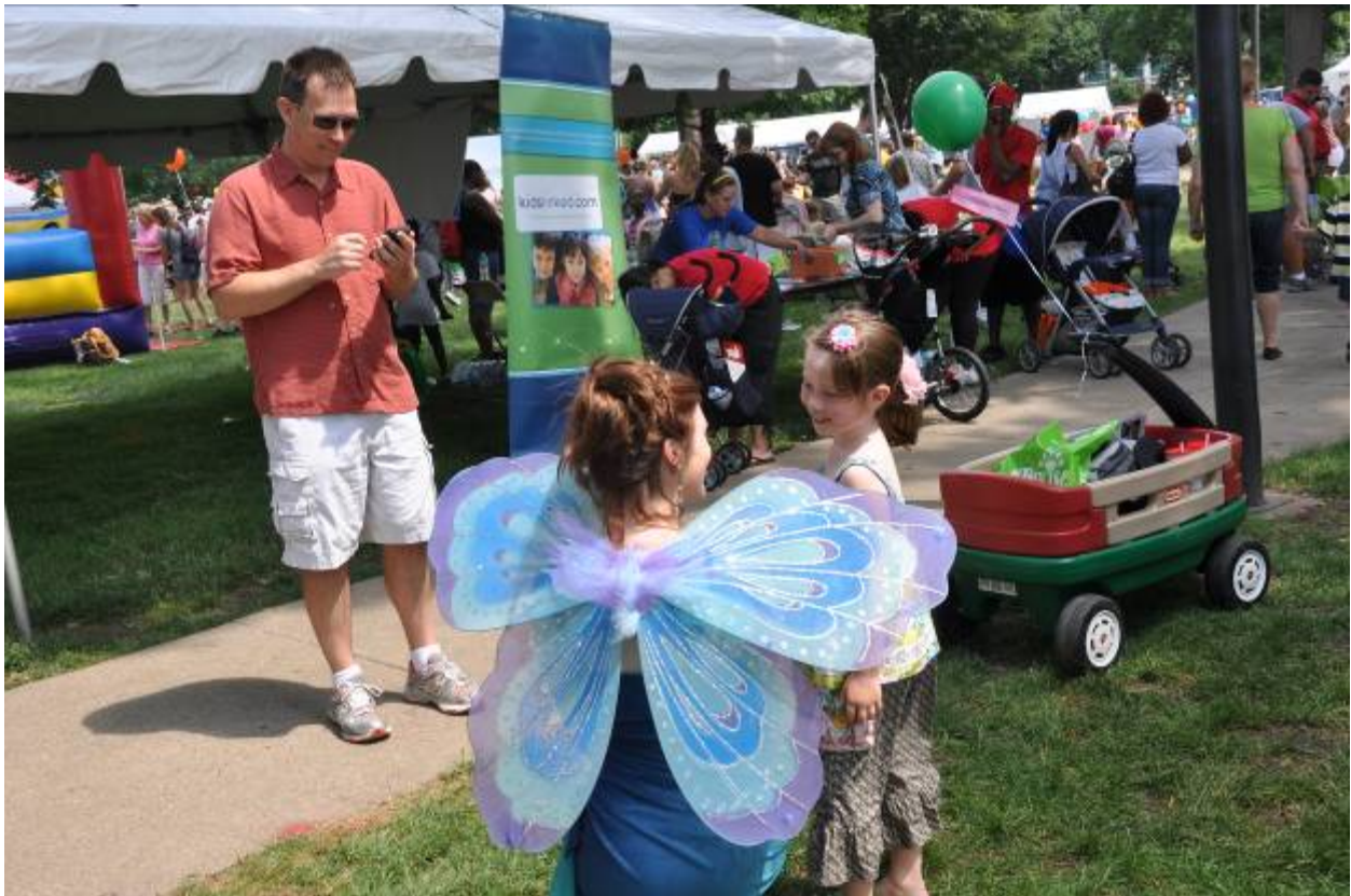
The Tooth Fairy wows youngsters at PBS's Kids in the Park, as members of the IU Dental School Kids Club (background) offer both parents and children tips on achieving and maintaining a healthy mouth.