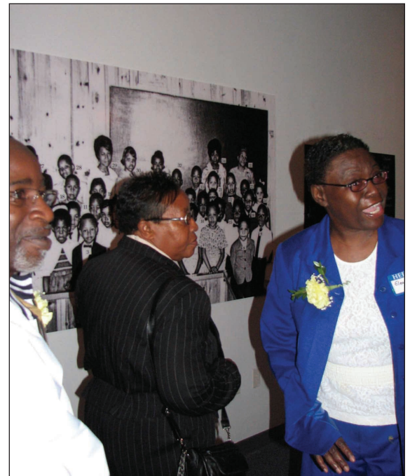
Former Baldwin Chapel students at "the Class of '63" exhibit opening.