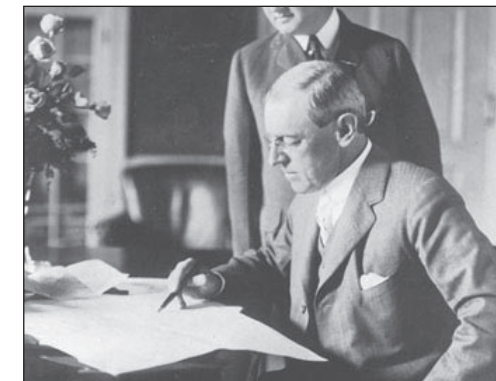
Woodrow Wilson in the Oval Office.

pass-through grants towards the establishment of a Woodrow Wilson presidential library in Staunton, VA, Wilson's birthplace.