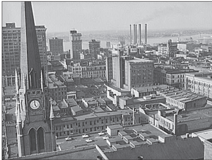
Downtown Louisville, 1940.