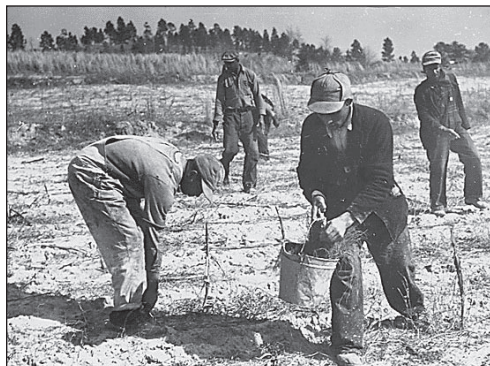
Civilian Conservation Corps enrollees clearing the land for soil conservation, 1934.