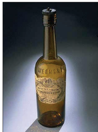
Bourbon bottle, 19th century.