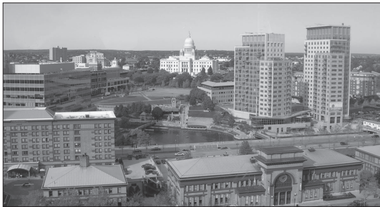
Board members met in Providence, RI, which will be the site of the 2008 NCPH Annual Meeting.

On Saturday, November 3, 2007, the NCPH Board of Directors convened at the John Nicholas Brown Center, Brown University, in Providence, RI, and took the following actions: