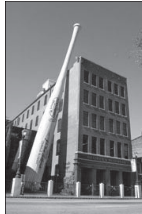
Louisville Slugger Museum.