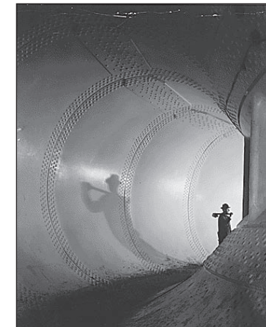
A Tennessee Valley Authority hydroelectric dam under construction.