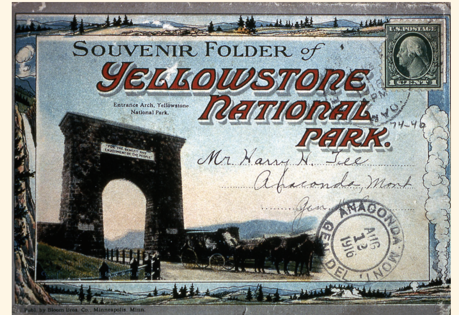
Souvenir Folder (postcard) of Yellowstone National Park; Sent August 12, 1916.