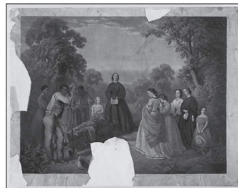
Engraving after a W. Dickinson painting of the funeral of William D. Latane, Confederate cavalry captain.

FamilySearch will make the digitized materials available for free through and in 4,500 family history centers worldwide, or on a subscription-based website operated by a third party, subject to National Archives approval. They will also be available at no charge in NARA's research rooms in Washington, DC, and its regional facilities across the country. In addition, FamilySearch will donate to the National Archives a copy of all the digital images and the associated indexes and other metadata that they create. This is one of a series of agreements that NARA has reached or will reach with partners to digitize portions of its holdings.