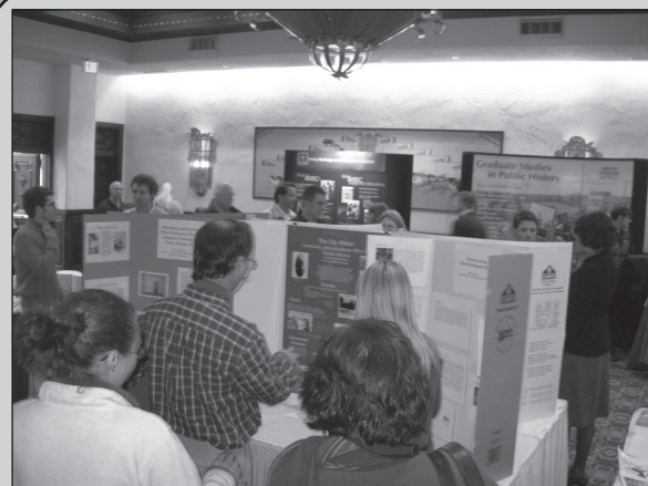
Poster session at Santa Fe meeting in 2007.