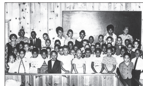
The photo that started it all: Students of the Baldwin Chapel School, 1963.