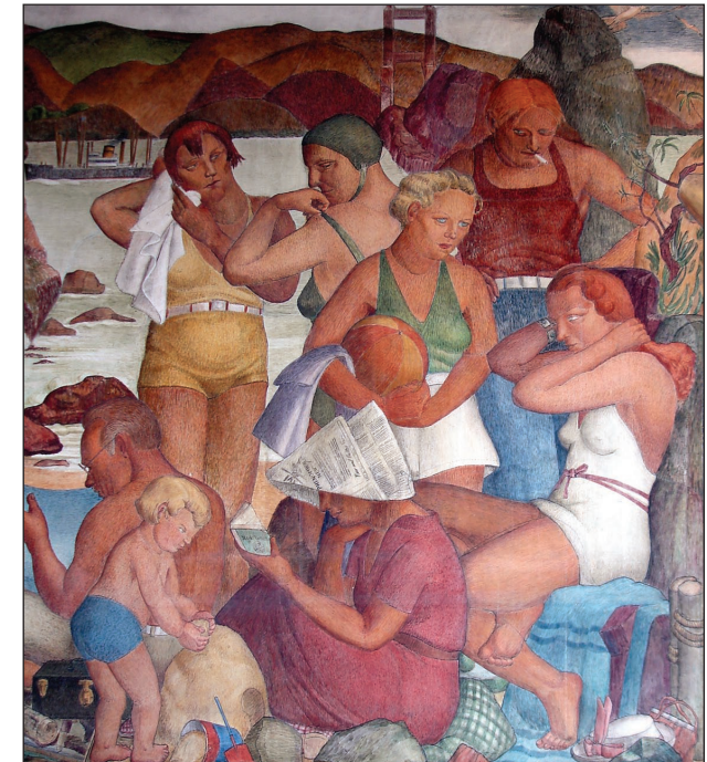
Federal Art Project mural at Golden Gate State Park's historic Beach Chalet, painted in 1936. Courtesy of Flickr.com user elston. See http://creativecommons.org/licenses/by-sa/3.0/ for license terms of this work.