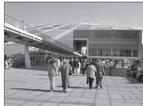
Bibliotheca Alexandrina of Alexandria, Egypt.