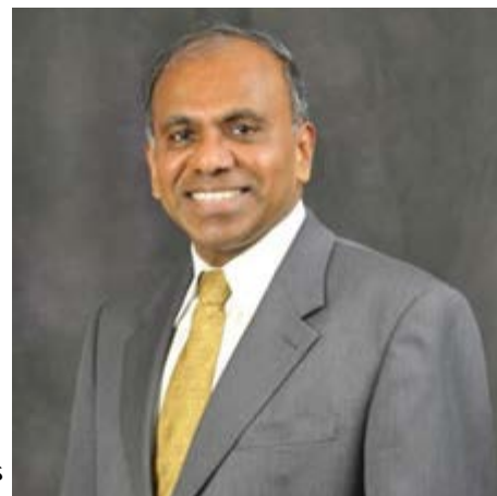
Dr. Subra Suresh, Director National Science Foundation