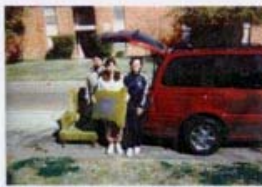
The rear seats are designed to quickly and easily allow the seat back to fold down and then for the whole seat to fold forward to provide about 3 feet of additional unobstructed hauling space in the rear. This allows large chairs, desks, etc. to be hauled without having to remove seats. These Taiwanese students live in an apartment with no furniture, i.e. no beds, chairs, etc. We delivered some chairs and a table to them that we had been given.

The Aldridge Foundation provides funds to lease and operate a van which is used extensively doing excursions, picking up students at airports, delivering donated furniture, and traveling between the various campuses involved.